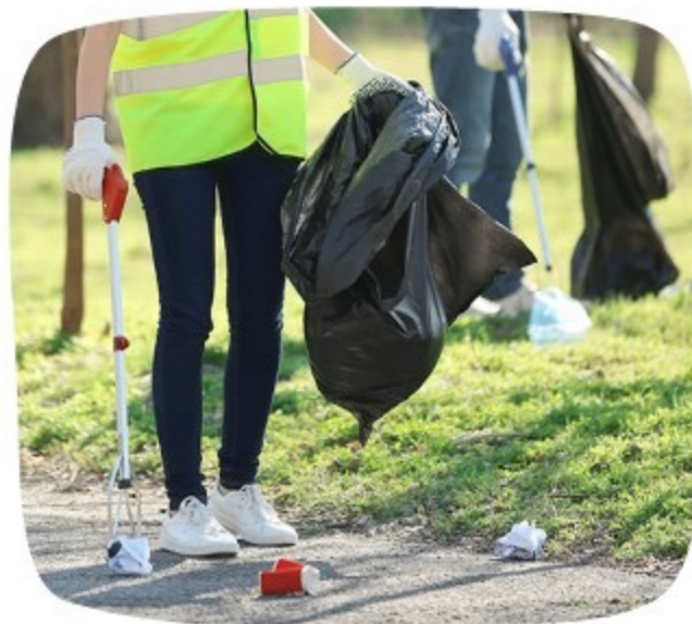
Pictured: people litter picking in their local area to help keep it clean and tidy.

Somebody who spends time organising events and activities for you to attend in your local area such as fairs, outdoor concerts, book swaps, parties, clubs.