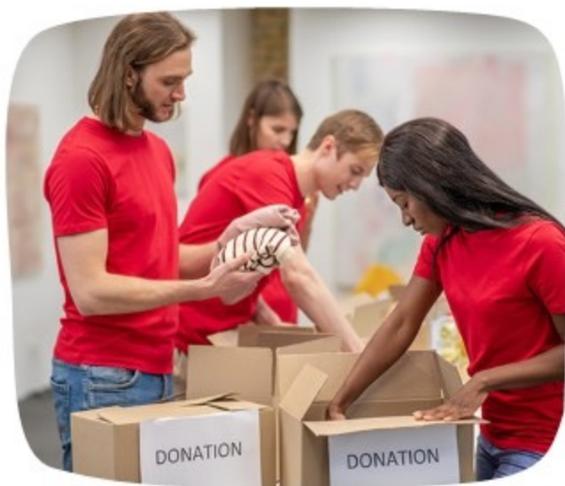
Pictured: volunteers sorting through food, water, blankets and other items to help those who need it.

Someone who always spots when others are hurt or feeling sad and checks they are okay. They always show kindness and care to others.