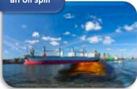
Hazardous material spill such as an oil spill