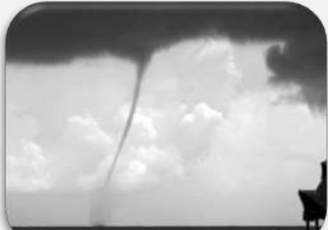
Hurricane forming over the warm ocean.

The scientific name for a hurricane, cyclone or typhoon is a tropical cyclone. They are all powerful, spinning storms that form over warm oceans. If the tropical cyclone forms in the Caribbean or North America region, it is known as a hurricane.